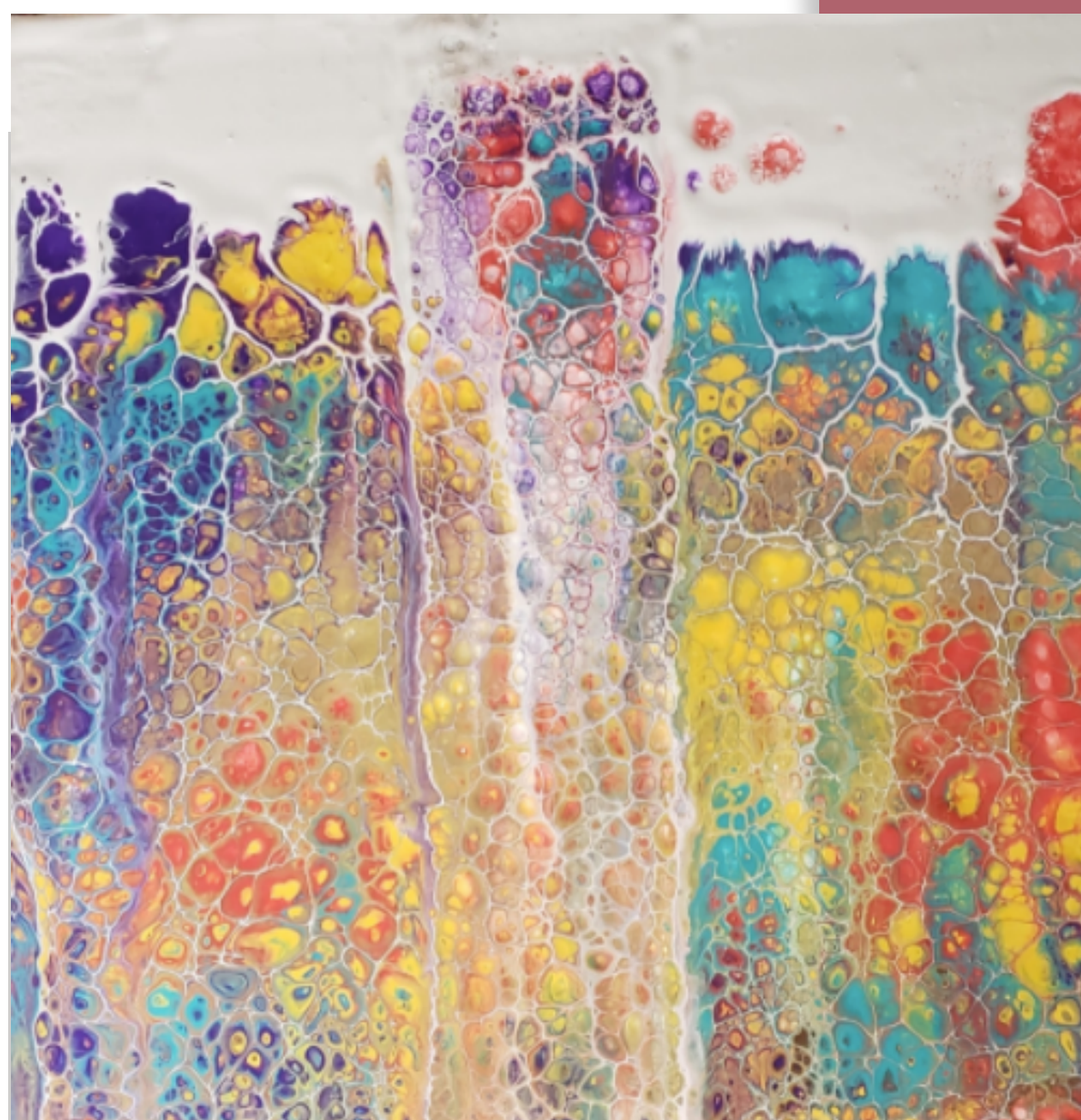
Acrylic Paint/Fluid Art on plywood "Let it Flow"