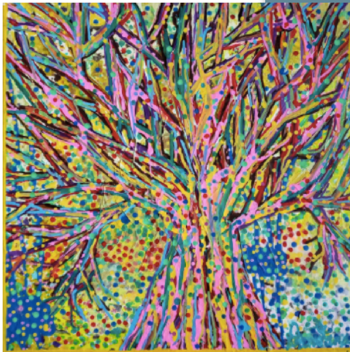
Acrylic Pen on canvas panel "Tree in Sunlight"